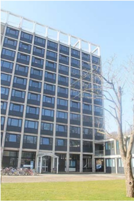
• CEFN BRYN RESIDENCE