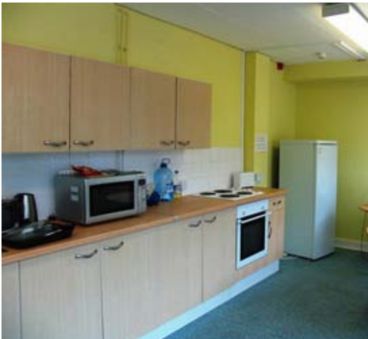
CEFBN BRYN COMMUNAL AREA