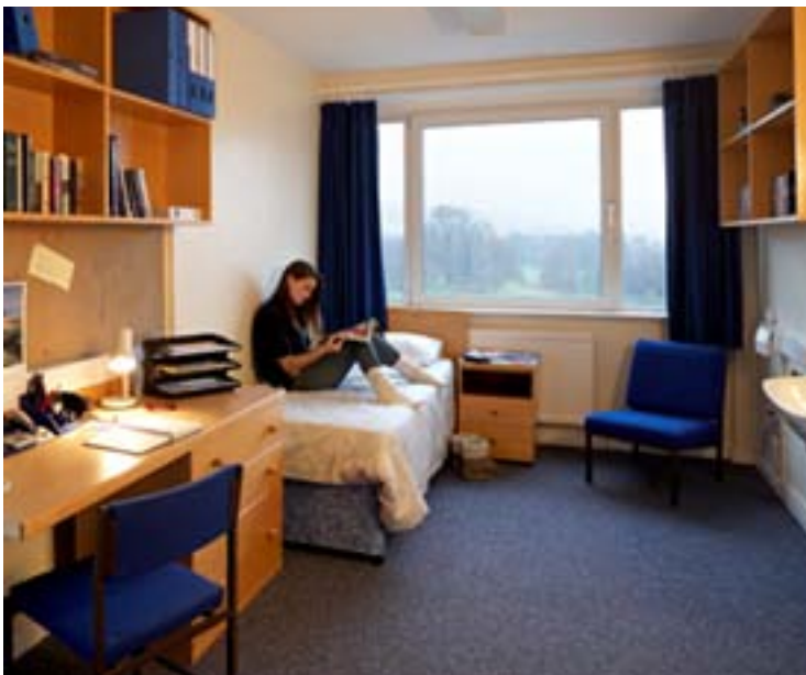
CEFBN BRYN BEDROOM