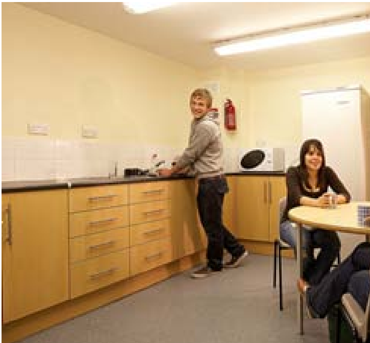
PENMAEN COMMUNAL AREA