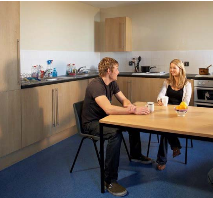
OXWICH COMMUNAL AREA