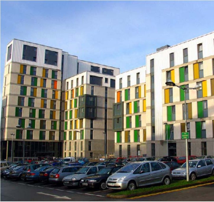
PENMAEN & HORTON RESIDENCES