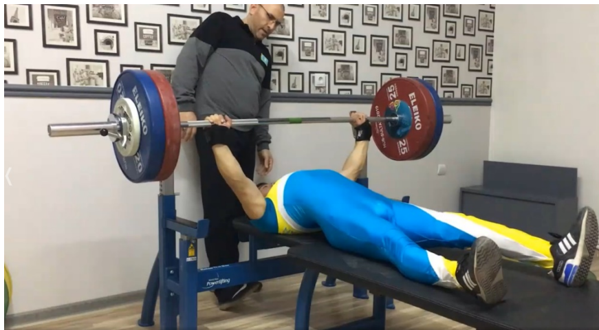
Example camera recording view