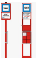
stops for buses and trams