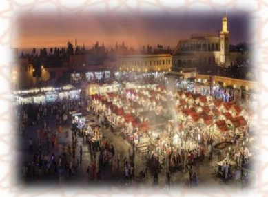
Place Jemaa EL Fna