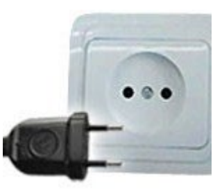
Type C: This socket also works with plug E and F