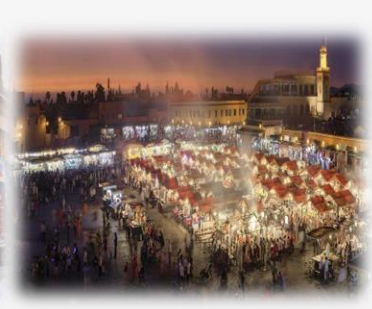
Place Jemaa EL Fna