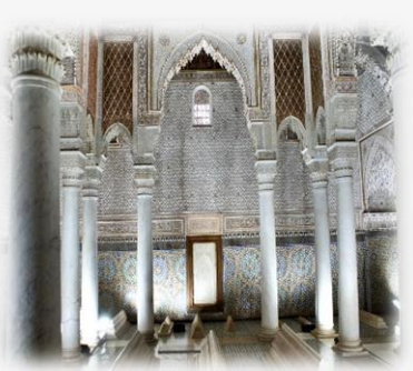
Les tombeaux Saadiens