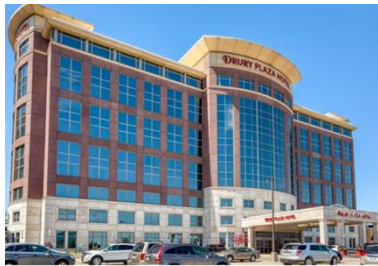
Drury Plaza Hotel St. Louis Chesterfield

Teams that arrange and pay the accommodation fee for early check-in and/or a late check-in will have access to meals provided at the host hotel during the scheduled dining times.