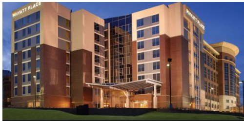
Hyatt Place Chesterfield