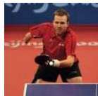
PARA TABLE TENNIS