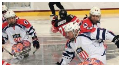
PARA ICE HOCKEY