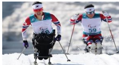
PARA CROSS-COUNTRY SKIING