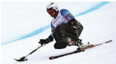
PARA ALPINE SKIING