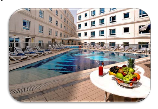
Accessible Swimming Pool