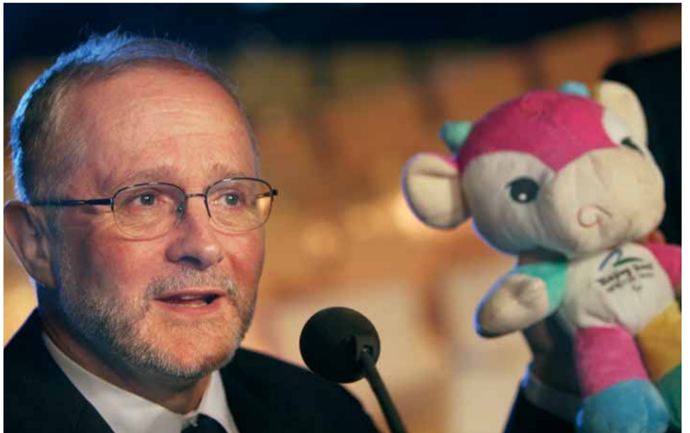
Sir Philip introduces Lele, the official mascot of the Beijing 2008 Paralympic Games.

The Beijing 2008 Paralympic Games will take place from 6 to 17 September 2008, with around 4,000 athletes from 160 countries competing in 20 sports.