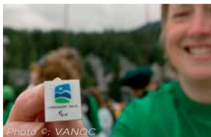
VANOC Launches 2010 Paralympic Emblem p.3