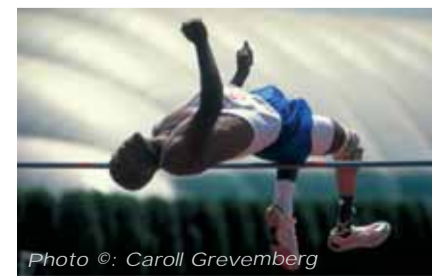
Atlanta 1996 Paralympics - Ten Years On p.12