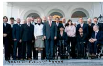
IPC Welcomes Two Gold Patrons p.4