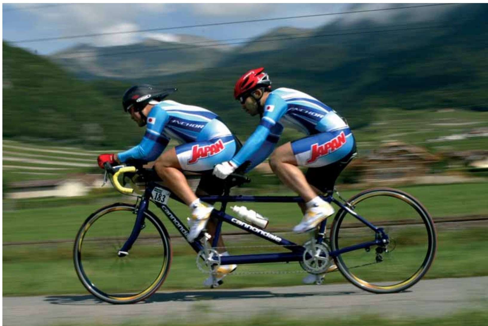
Japan in action on the road at the 2006 IPC Cycling World Championships.

Women on the Rise in Paralympic Sport p.10