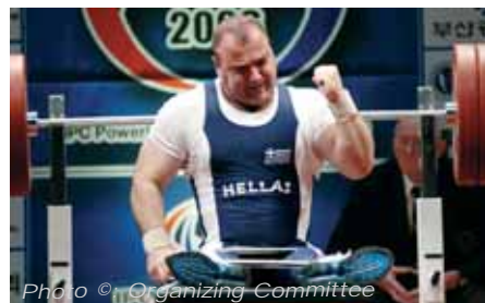
Powerlifting Welcomed in Korea p.8