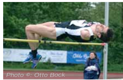
Otto Bock Hosts Paralympic Challenge p.7