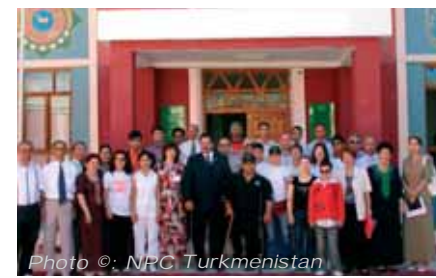
IPC Grants Make Worldwide Impact p.10