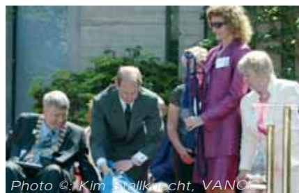
Paralympic Flag Raised in Vancouver p.3