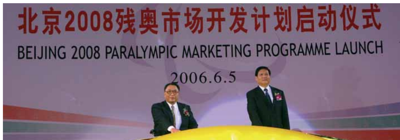
BOCOG President Liu Qi (right) and Deng Pufang, President of the China Disabled Persons' Federation and BOCOG Executive President (left).

For more information please visit the official BOCOG website at www.beijing2008.com .