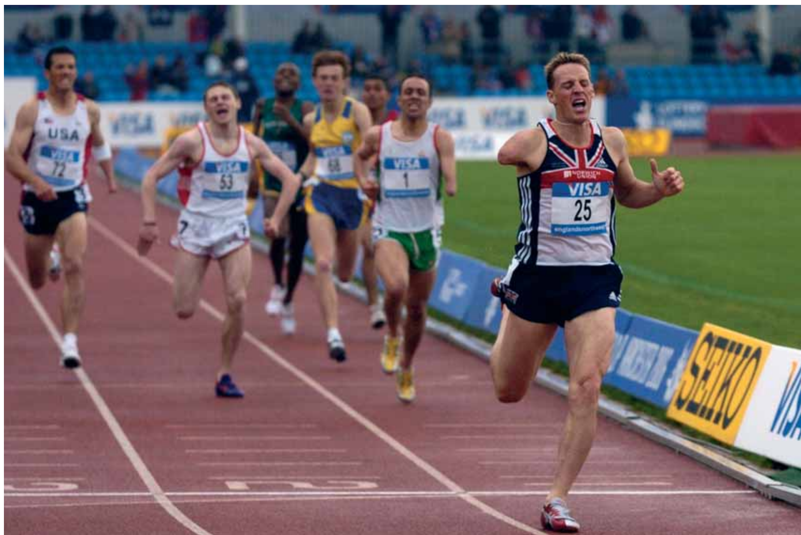
Action from the 2006 Visa Paralympic World Cup.

Ernst Van Dyk Wins Prestigious Laureus Title p.12